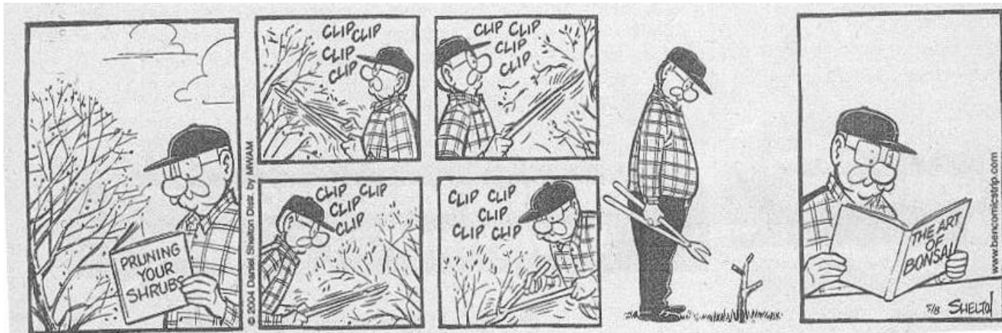
(‘BEN’ Taken from the Times Colonist)