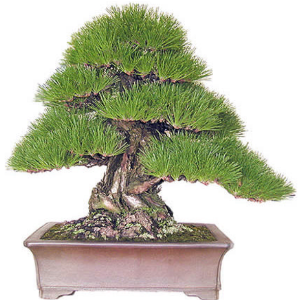
Japanese Black Pine