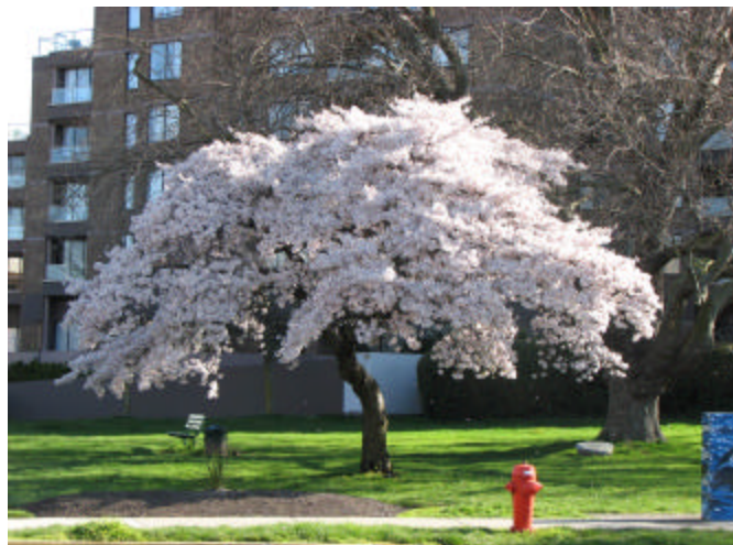
Cherry Blossoms (Spring is finally here!)

The club address is: The Vancouver Island Bonsai Club P.O. Box 8674 Victoria, B.C. V8W 3S2 http://www.victoriabonsai.bc.ca