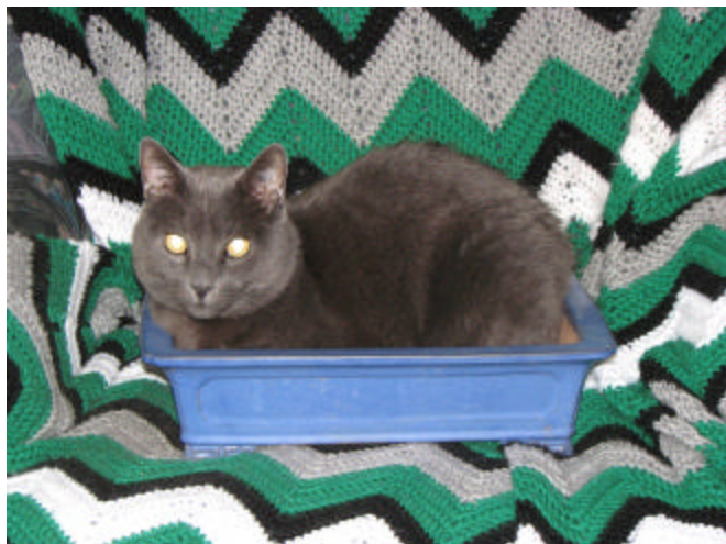
Latest Style " Bonsai Kitty"

June - Show & Tell - Shohin & Mame Panel Discussion - Is your tree really sick? (Bring in your ailing trees for advice) 5 simultaneous demos on pruning and pinching. Pines, spruce, juniper, chamaecyparis.