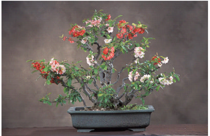
This is a photo of a 128 year old Japanese Quince. Chanenomeles speciosa , cultivar Toyo-nisiki.