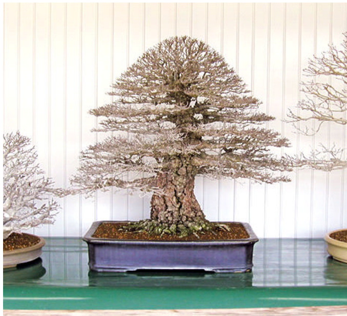
Cork Bark Elm

Here are some truly awe inspiring winter silhouettes which one can only dream about, enjoy!