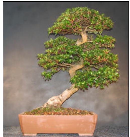
Satsuki Azalea “Kaho”