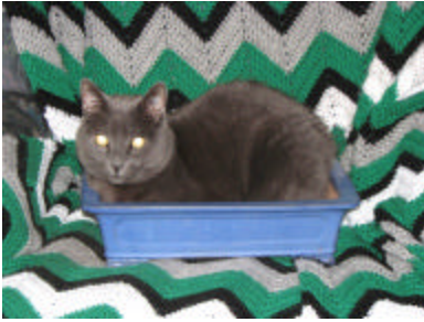
Bonsai Cat in Pot