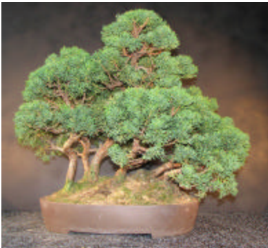
Juniper Grouping 2009