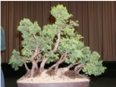
Juniper Grouping 2004