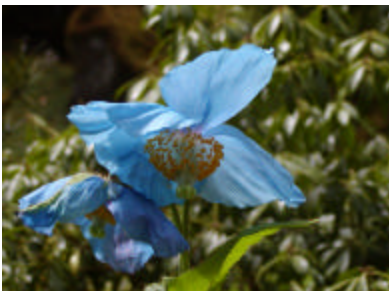
Spring Has Finally Sprung?