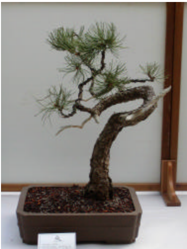
Previous Mall Show Exhibits