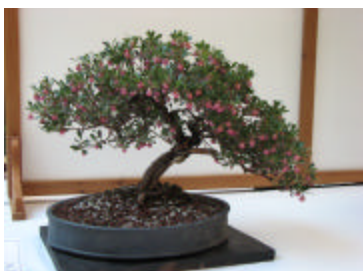
Some of our 2009 Mall Show participants