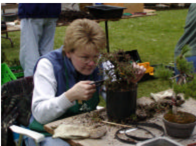
Previous Field Day Participants

This year the club will have an information/demonstration table at the show.