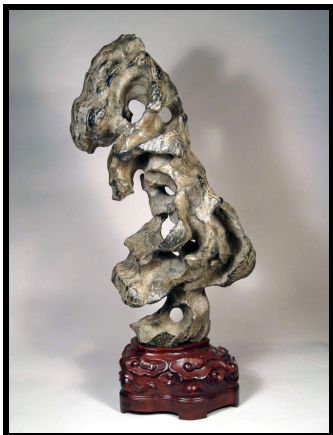
Lingbi Stone - China