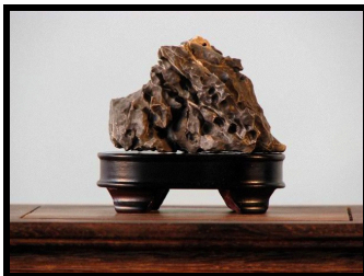
Vancouver Island Limestone