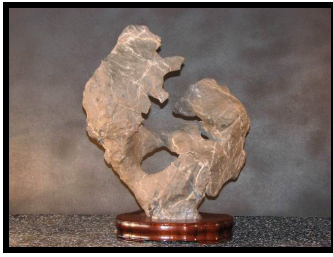
Vancouver Island Limestone