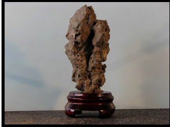
Vancouver Island Limestone