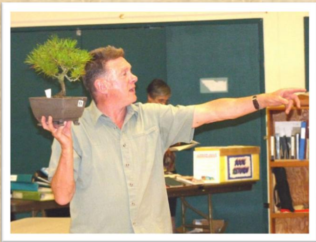
the Auctioneer 2010

Our annual auction is always a popular event and for good reason: many good bonsai got their start here. On occasion, I have been pleasantly surprised to hear that a bonsai I have been admiring got its start as an auction purchase. Plan to attend and spend a ton of money - it benefits the club greatly! If you have quality bonsai that you would like to enter into the sale, and would be content to take home half of what they sell for, please plan to arrive early at the meeting so that items can be assessed and numbered.