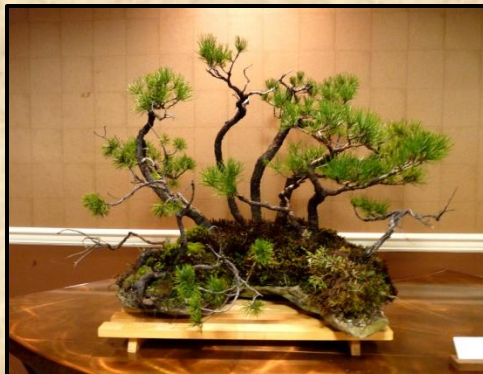
Literati Shore Pine Forest