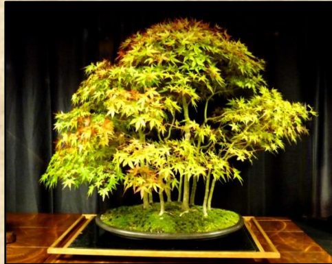
Japanese Maple Forest