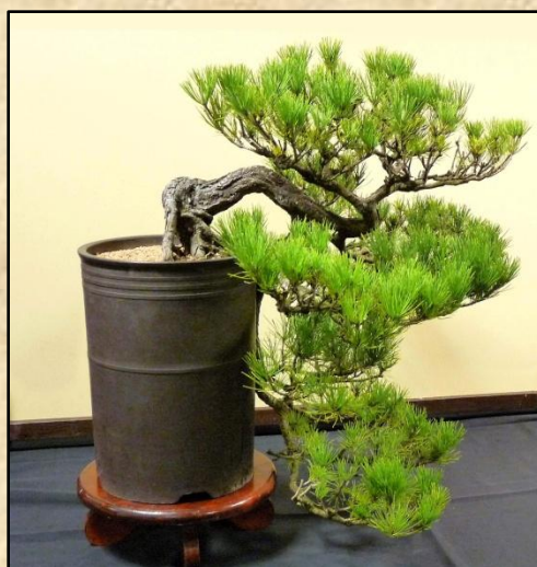
Cascade-style Japanese Red Pine

... some of the 50 bonsai on display at the Convention.