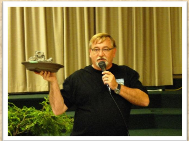
the Auctioneer 2011