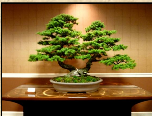
Twin-trunk Mountain Hemlock

... some of the 50 bonsai on display at the Convention.