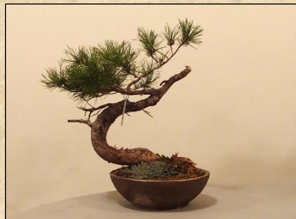
... and, of course, a Pine!