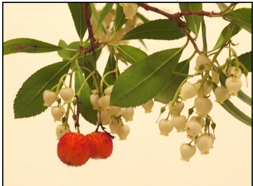
Flowers and fruit on Arbutus unedo

A Request for scent-free meetings: People sensitive to scents can come down with severe headaches and feel quite unwell after exposure. Out of consideration for our fellow members, we would ask that our meetings be scent-free.