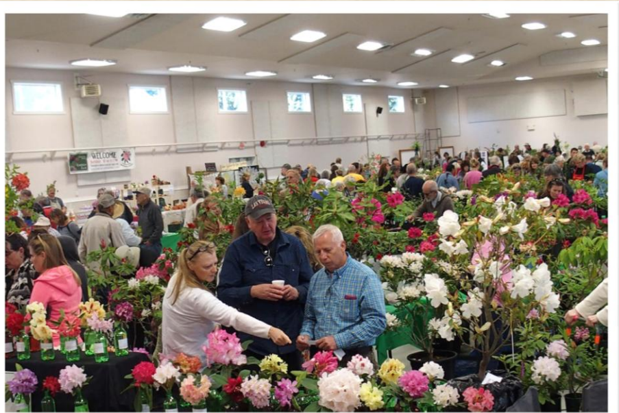
Mellor Hall, Duncan