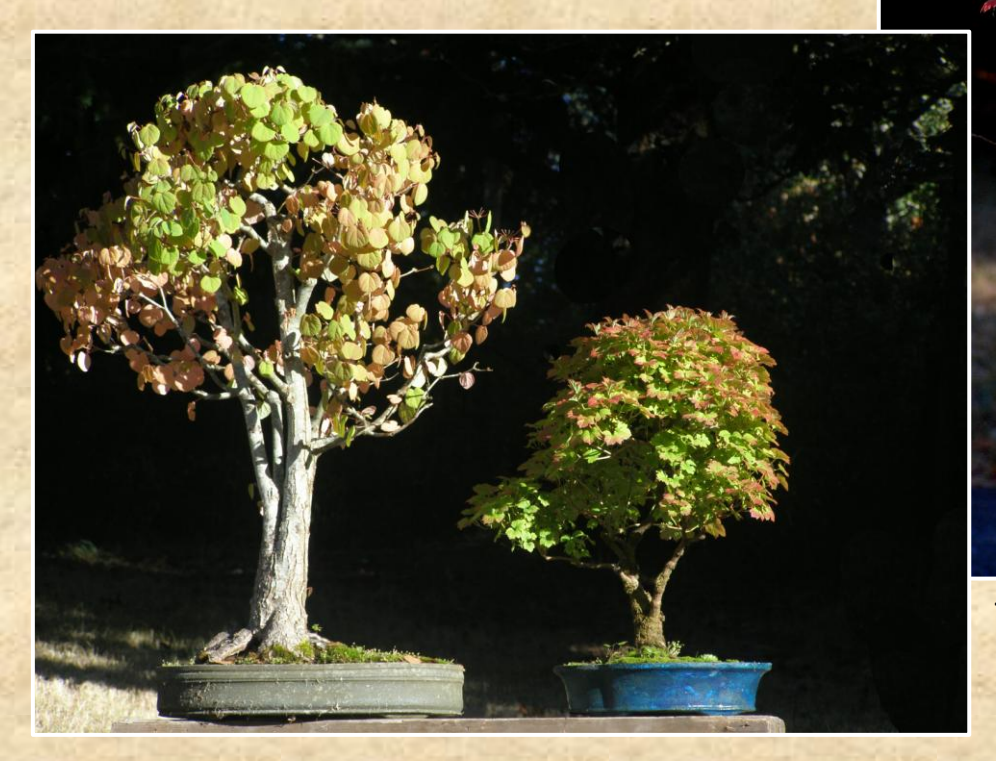
The Vine Maple (above) shows a reddening of the leaves more reminiscent of Fall coloration.

Our long hot and dry Summer made some of my trees behave a bit out of "phase". Attached are some photos that show what I am talking about. A Katsura, a Viburnum (Opulus) and a Vine Maple. The question could be ... Is it early Fall or Stress...? Perhaps a little bit of both...?