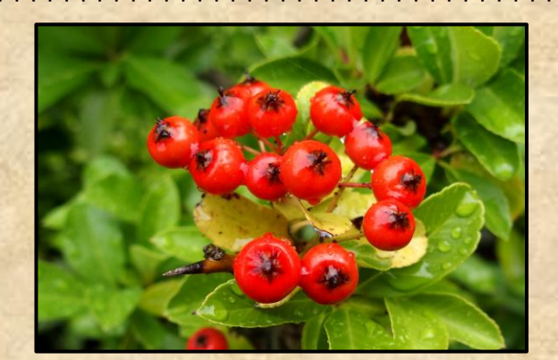
A sure sign of Fall – red berries on Pyracantha